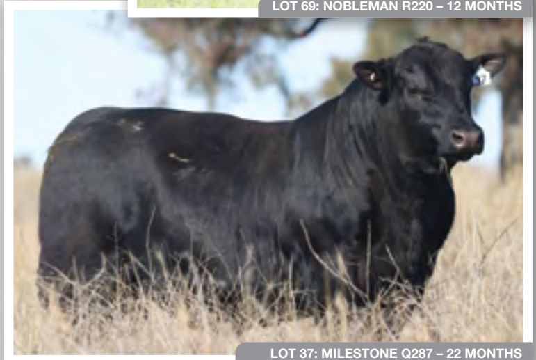
LOT 37: MILESTONE Q287 – 22 MONTHS

Other sires include MARLON BRANDO & MILESTONE M308 with 10 sons apiece & proven favourites KRUSE TIME, CHISUM 255 & LOCH UP.