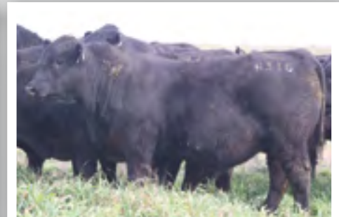
LOT 87: KRUSE TIME R316 – 11 MONTHS