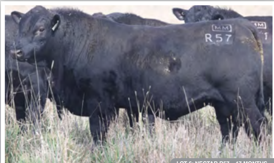
LOT 6: NECTAR R57 – 17 MONTHS

NECTAR N334 sons set the recent Heart Angus sale alight, selling to the sale top of $30,000 twice. A son of Coonamble Hector, Nectar is another bull whose structural credentials go from strength to strength as the progeny mature. He has 10 sons in the sale.