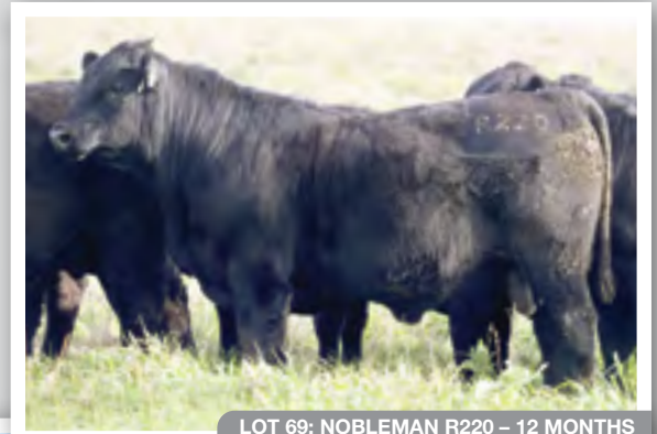
LOT 69: NOBLEMAN R220 – 12 MONTHS

was the 2nd high selling bull at Landfall's record setting 2019 sale and introduces a new line for us with 10 sons in the yearling section. Calving ease is a feature on paper and phenotypically with their length and lovely clean front ends.