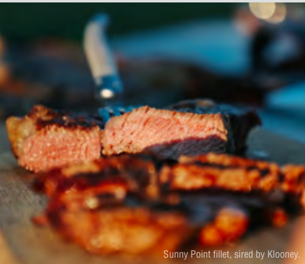
Sunny Point fillet, sired by Klooney.

Measured objectively , JS Grazing at Injune is consistently achieving an MSA index above 62 per consignment of 100+ steers to Coles, dwarfing the overall cohort results each time.