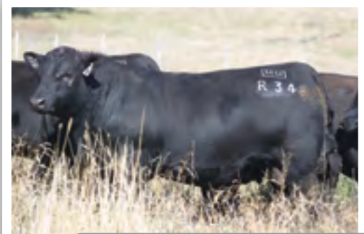
LOT 95: POWERPOINT R34 – 17 MONTHS