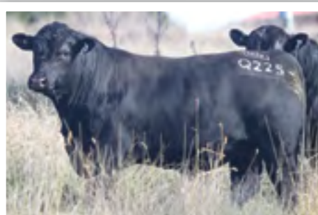
LOT 43: MARLON BRANDO Q225 – 22 MONTHS