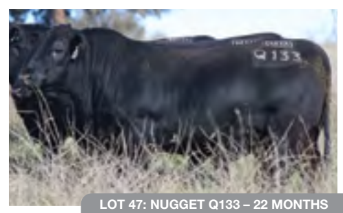
LOT 47: NUGGET Q133 – 22 MONTHS