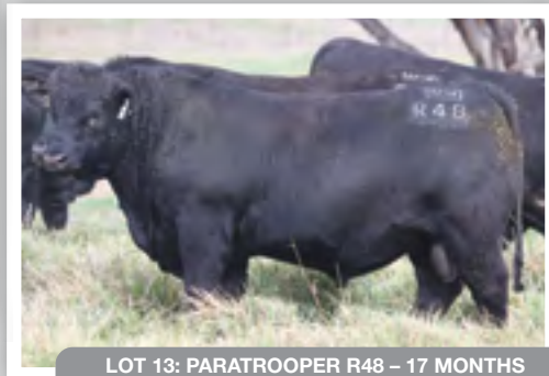
LOT 13: PARATROOPER R48 – 17 MONTHS