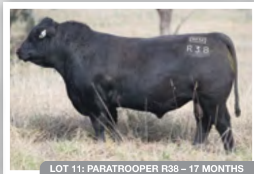
LOT 11: PARATROOPER R38 – 17 MONTHS