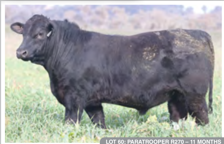
LOT 60: PARATROOPER R270 – 11 MONTHS