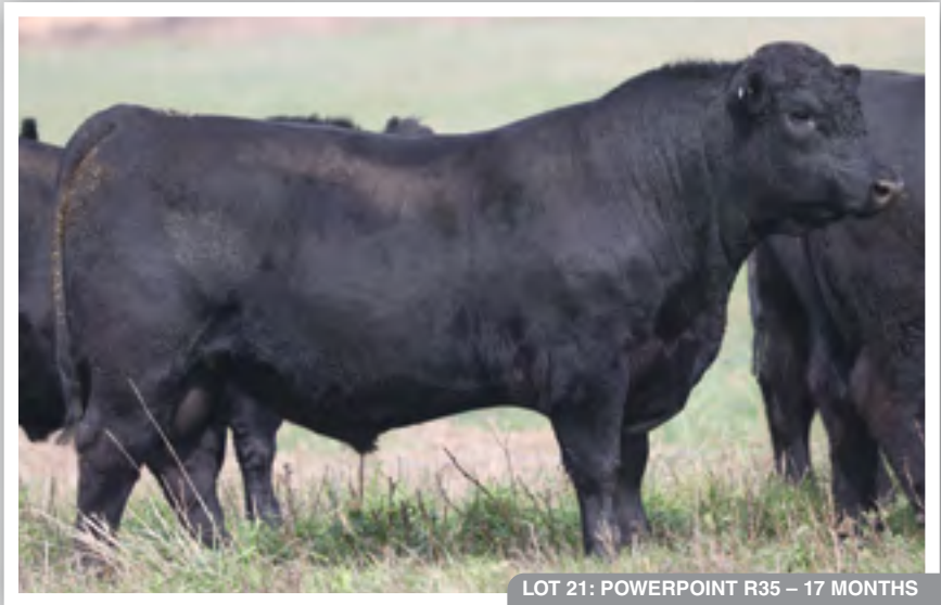
LOT 21: POWERPOINT R35 – 17 MONTHS

SPICKLER POWERPOINT has found his niche in our herd with a cracking flush of 5 sons from Hallmark cow Flower N61, and some other feature Lots including a son from Klooney's dam Prue H4. Powerpoint is passing on his incredible fleshing ability and with stablemate Chisum 255 provides an excellent outcross for our programme. 10 sons sell.