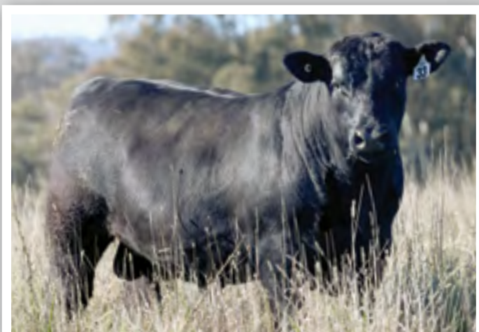
LOT 33: PARATROOPER R106 – 16 MONTHS

A highlight subset of the Paratrooper sons is a group of 10 with dams by Kingdom. Paratrooper usurped Kingdom as the breed record priced bull, and the cross always struck as a perfect blend. The result is as good as anything we have ever produced.