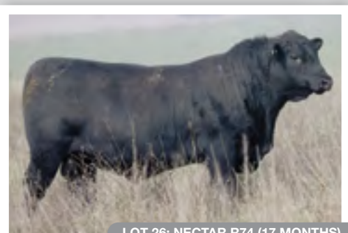
LOT 26: NECTAR R74 (17 MONTHS)