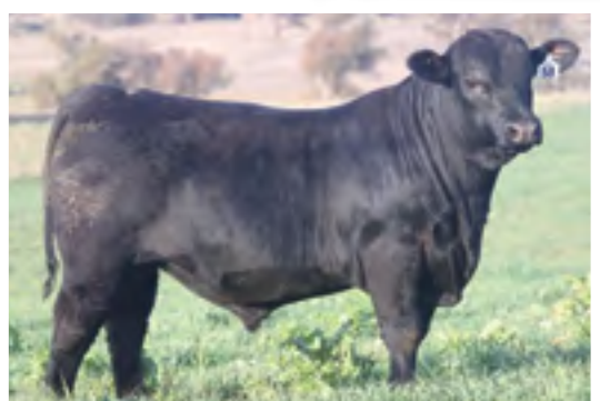
LOT 58: PARATROOPER R275 – 11 MONTHS